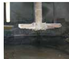
Mixer blade protection