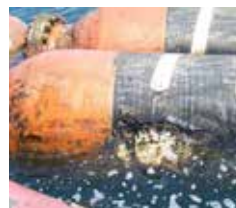
Floating hose repair