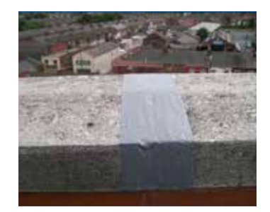
Parapet walls & coping stone joints

For more information, please contact your local Belzona representative: