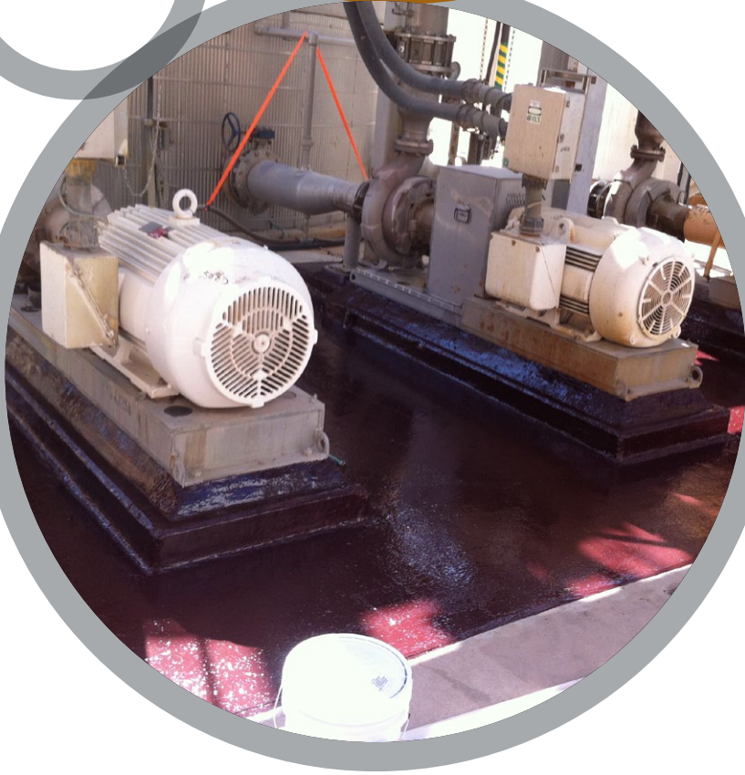
Chemical Containment Areas

For more information, please contact your local Belzona® representative: