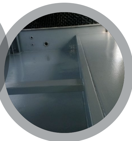
Cooling Tower Basin